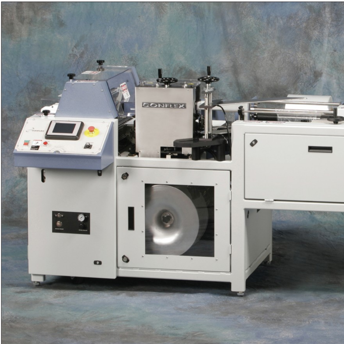
AdvantEDGE 160 Rotary shown

The Next Generation in Side-Seal Equipment